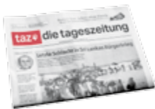
»» THE NEWSPAPER

More than 18,000 readers continue to secure the independence of their newspaper with a total capital of 18 million euros, without deriving any financial benefit themselves. What they do expect in return is a valuable commodity, but one that can't be bought: an independent press.