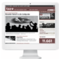
»» WWW.TAZ.DE Online daily. Since 1994

The taz is more than just a newspaper. Once a month it also features a complete monthly journal: since 1995, the publishers of the taz have been responsible for the publication of the German-language edition of the French monthly paper 'Le Monde diplomatique'. And this special edition of the taz only costs approximately 70 cents more than usual – more than that, for subscribers to the taz, this journalistically top-class extra is completely free. Since 2003, the German editorial team of the 'diplo' has edited seven different issues of the comprehensive 'Atlas der Globalisierung'; twice a year they publish the journal 'Edition Le Monde diplomatique' with its focus on special issues or countries.