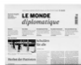
»» LE MONDE DIPLOMATIQUE Every month. Since 1995

FOR EDITORIAL INDEPENDENCE AGAINST MONOPOLIES OVER PUBLIC OPINION