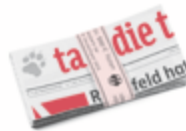
»» INVEST IN IDEALS Join the taz Cooperative Society

INDEPENDENCE COMES AT A COST JOIN THE COOPERATIVE